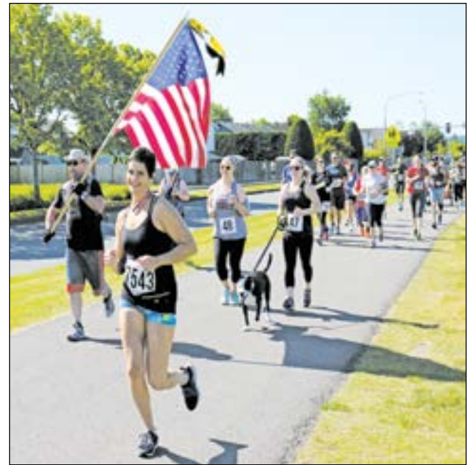
VFW Post 7511 and its Auxiliary's seventh annual Flags for our Fallen 5K run/walk and Kids 1K run/walk event is Saturday, May 20 at Lake Tye Park in Monroe. This family-friendly community event begins at 9 a.m. For more information visit www.flags4fallen.com

Aug. 11: Movies Under the Moon – 'The Croods: