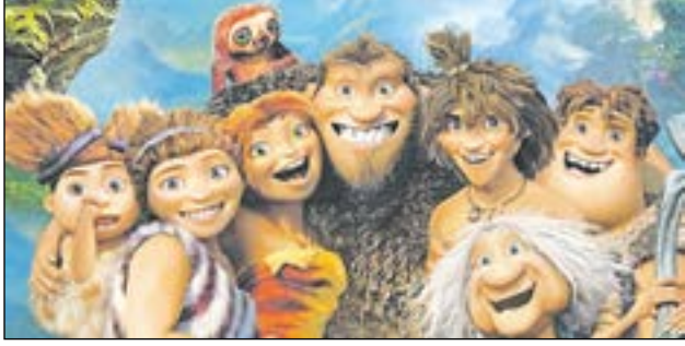
The Croods: A New Age