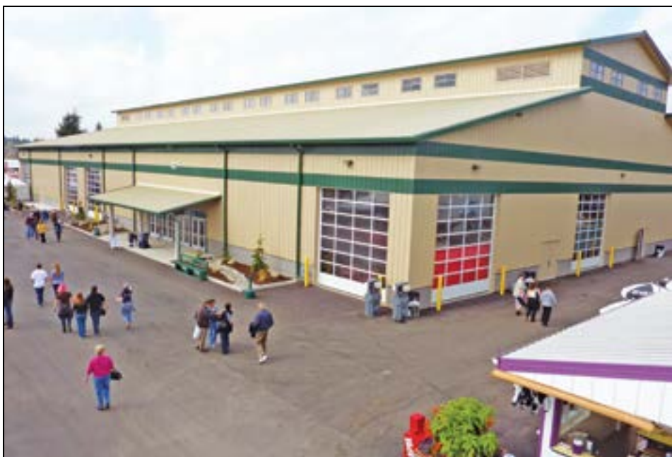
The Gary D. Heikel Event Center is a 33,000 square foot building with attached restrooms.

The fun at the Evergreen State Fairgrounds isn't confined to just the Fair (Aug. 24-29 and Aug. 31-Sept. 4). No, the grounds are used all year round. There are animal shows, both domestic and farm; swap meets, collectibles and special interest shows such as quilt shows, woodcarving shows, hobby shows and craft markets, as well as the popular auto racing at the Evergreen Speedway. Are YOU planning an event? If so, the Evergreen State Fairgrounds can provide a unique venue to host your activity. With 194 acres, 14 buildings, top notch equestrian facility, ample parking and RV camping, the Evergreen State Fairgrounds has something for everyone! The Fairgrounds is centrally located with easy access from Highway 2 and Interstate 522 with nearby hotels, businesses and restaurants making it very convenient for exhibitors and attendees. Meetings, conventions, conferences, trade shows, social events, animal shows, equine events – when people gather, the Evergreen State Fairgrounds is the perfect location! The Fairgrounds prides itself on exceptional customer service and welcomes you to check out their facilities! Want to attend an Event? – Check out their Calendar of Events at www.EvergreenFair.org to find out dates, hours, locations and contact information.