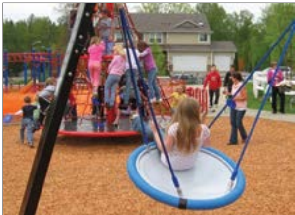
Rainier View Park playground.

• Blueberry Children's Park: 18399 Blueberry Lane ~ This is a small park with benches, drinking fountain, picnic tables and playground.