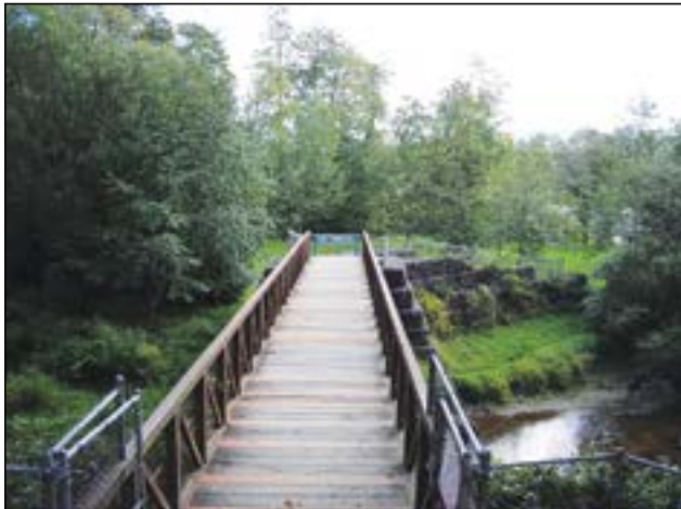
Al Borlin Park park is accessible by this footbridge from Lewis Street Park or by vehicle via Simons Road.

• Al Borlin Park (Buck Island): 615 Simons Rd. ~ Accessible by the foot bridge from Lewis Street Park or by auto via Simons Road. This is a day use facility with great river fishing, sandy beach for swimming and picnicking, and is criss-crossed with a network of wooded trails totaling 1.2 miles and the park itself is 90 acres.